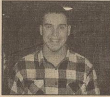
Boddison is favourite